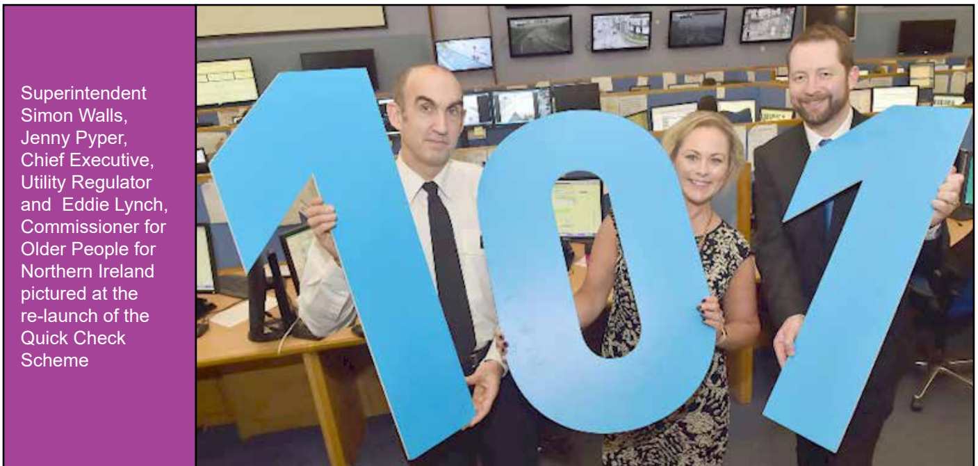
Superintendent Simon Walls, Jenny Pyper, Chief Executive, Utility Regulator and Eddie Lynch, Commissioner for Older People for Northern Ireland pictured at the re-launch of the Quick Check Scheme

The scheme is not only a collaboration between the PSNI and the Utility Regulator, but also includes all of Northern Ireland's energy and water network companies - firmus energy, NIE Networks, Northern Ireland Water, Phoenix Natural Gas and SGN Natural Gas. Supported by the Commissioner for Older People, the initiative is being re-launched in a bid to help people feel safer in their homes.