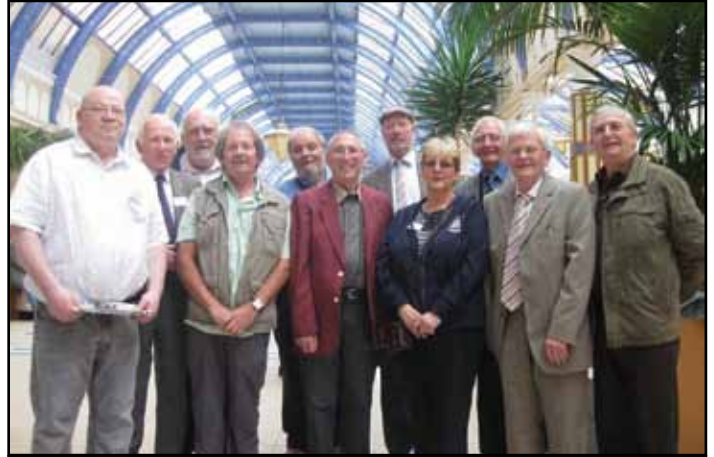
Some of the delegates from Northern Ireland

The Parliament, which was held at the Winter Gardens in Blackpool, took place during 14-16 June and saw delegates from across the UK gather to discuss areas such as pensions, health and social care, age equality, and transport.