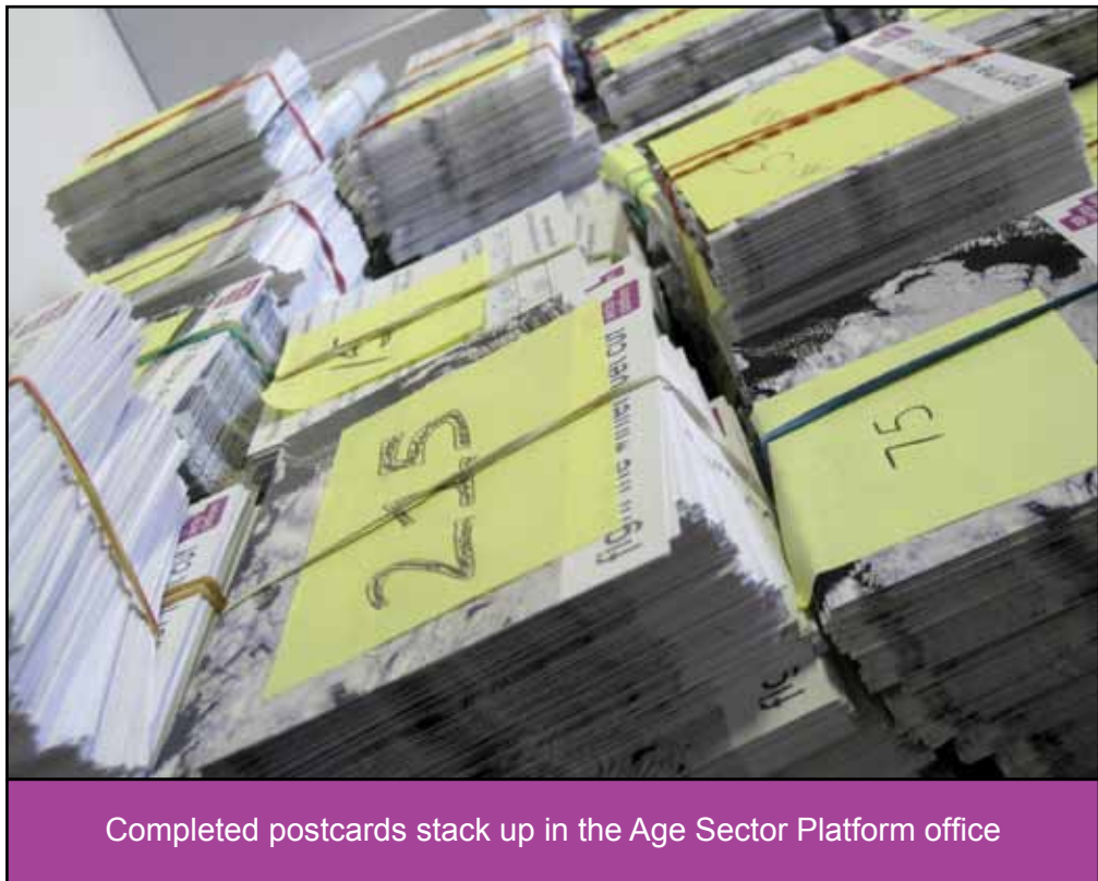
Completed postcards stack up in the Age Sector Platform office

The campaign is in opposition to the cut in the Winter Fuel Payment this year by the Coalition Government. It allows people from across the province to show their support by signing a petition which will be presented to the UK Government at the end of this month (October). At the time of printing over 9,000 signatures have been registered in support of the motion to reverse this decision, and the support shows no sign of slowing with hundreds of petition postcards being requested every day.