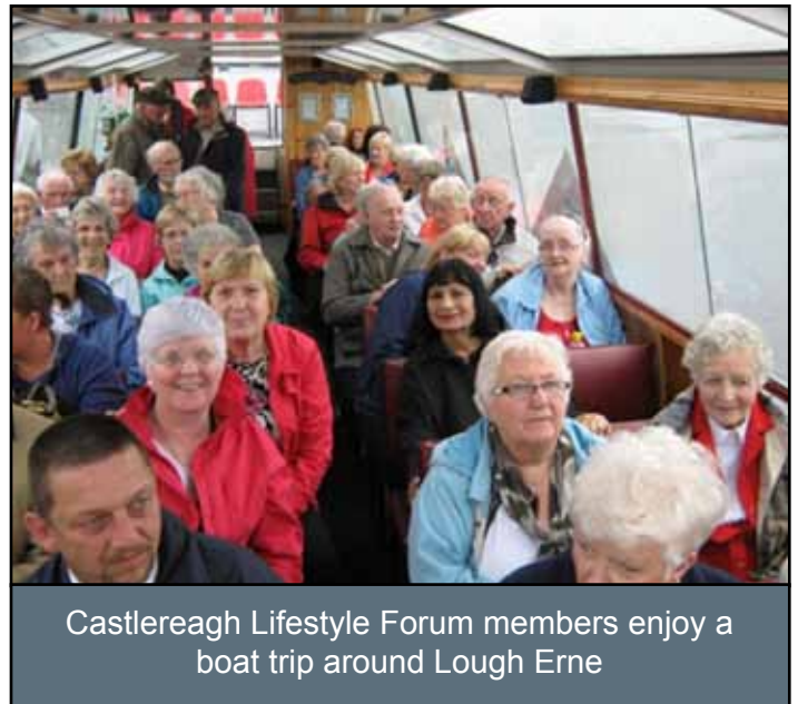
Castlereagh Lifestyle Forum members enjoy a boat trip around Lough Erne

Members of the Castlereagh Lifestyle Forum are represented on the Greater Belfast Seniors Forum (G6) which is made up of representatives from all 6 forums throughout the Greater Belfast area. The G6 meet monthly in Belfast City Council to lobby and be an advocate for older people. Members of the Castlereagh Lifestyle Forum are represented on various other relevant bodies including Age Sector Platform, Engage with Age Board, Age Partnership Belfast and Community Safety Partnerships.