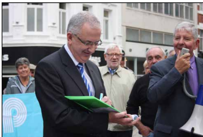
Transport Minister Danny Kennedy supports the retention of the bus pass and other universal pensioner benefits by signing the ‘Hands Off’ petition at the rally

“The bus pass is one of the most valued schemes provided to older people in Northern Ireland. It enables older people to do essential shopping, maintain social networks, attend health appointments, and keep physically active. Without it, my generation would simply be unable to remain as healthy and independent. DRD Minister Danny Kennedy’s recent comments about threats to funding for the scheme must be taken seriously, and our politicians must continue to stand united in supporting the need for the scheme.”