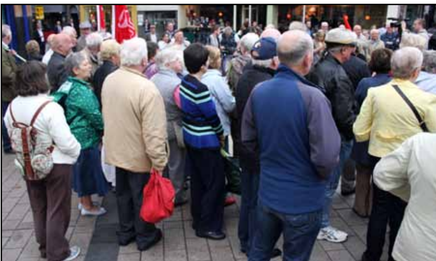
Over 100 people attended the 'Hands Off' rally in the Cornmarket area of Belfast City Centre

benefits like the bus pass and free prescriptions, whilst political parties and think tanks in Britain continue to question whether pensioners 'deserve' their winter fuel payment and free TV licence. This rally was our opportunity to show how passionately we feel about the value of these benefits. We must ensure they are protected for pensioners now and in the future."