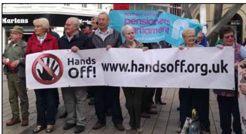
Pensioners say ‘Hands Off’ at rally in Belfast’s Cornmarket

“At the Northern Ireland Pensioners Parliament earlier this year, two motions were passed calling for the protection of universal pensioner benefits with an overwhelming majority of 99 per cent. This shows how much these benefits are valued by older people in Northern Ireland, and we must ensure they remain for years to come.”